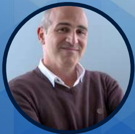
Hernán Míguez Institute of Materials Science of Sevilla (ICMSE) Spain